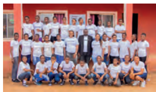
Queens Model School, Nigeria