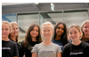
FvAG, Bad Friedrichshall