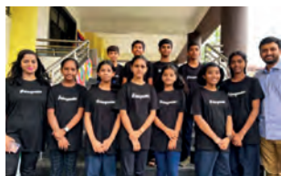
CSMEM School Kasarwadi, India

The schools will present themselves and their ideas at the 2nd SDG Youth Summit. present their ideas. The exchange and cooperation between the different schools and cultures are invaluable and contribute to creating a more sustainable world.