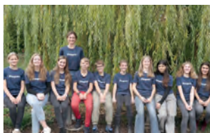
Ellental Gymnasium, Bietigheim