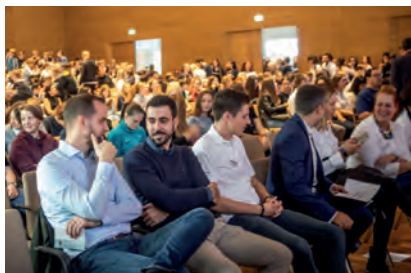
Bilder vom 1. SDG Jugendgipfel 2019 in Heilbronn, Bildungscampus